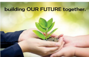
building OUR FUTURE together.