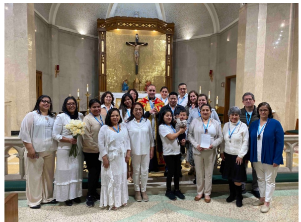
Primer grupo consagrado a Jesús por María.